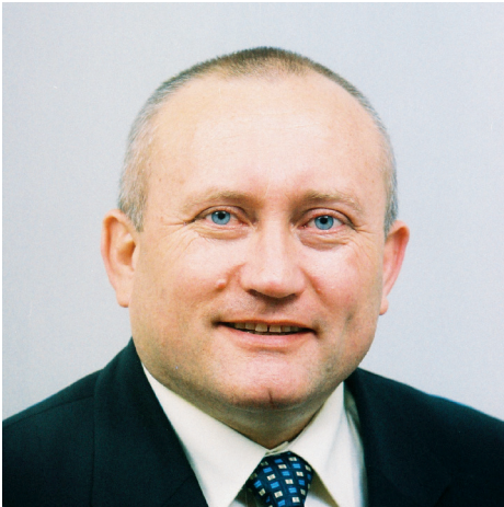
Leonid Rubanenko President Union of Taxadvisers of Ukraine

office 7, 13 Gorkogo street, Kyiv, Ukraine, 01004 +380 (44) 289 35 93